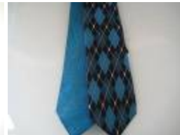
Alfani Red Aqua Mist