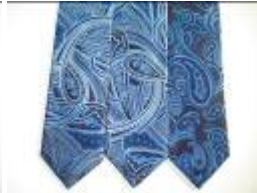
Tasso Elba Aqua Paisley