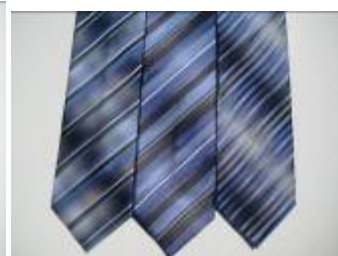
South Beach Stripe Pack B