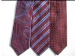
Tasso Elba Wine Berry Story