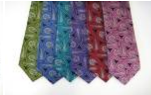
CO050127 Black Magic Paisley