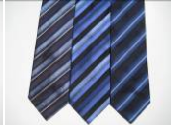
South Beach Stripe Pack A