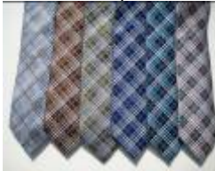
PE051708 Barnaby Grid