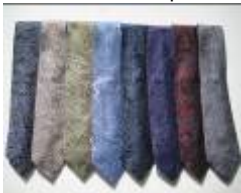
PE050108 Oliver Paisley