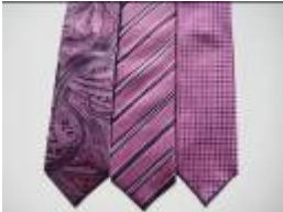
Tasso Elba Rose Berry Pack

BRANDS: ALFANI, ALFANI RED, BEN SHERMAN, COUNTESS MARA, GEOFFREY BEENE, JOHN ASHFORD, PENGUIN, PERRY ELLIS, TASSO ELBA, TASSO COLLEZIONE