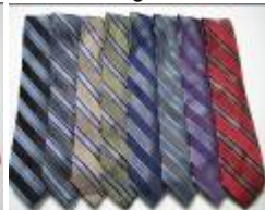
PE050617 Limestone Stripe