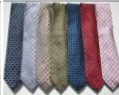
PE051402 Clarence Stripe