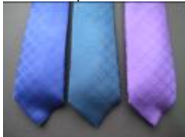
Ben Sherman Dickens Solid