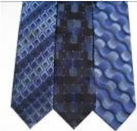
South Beach Geo Pack A