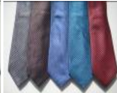
PE050701 Everett Neat