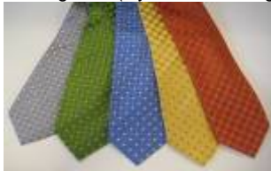
CO051746 Bari Grid