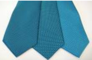
Countess Mara Parma Wardrobe