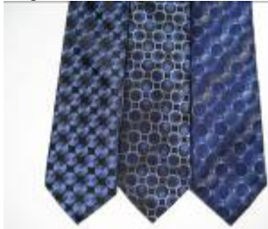
South Beach Geo Pack B