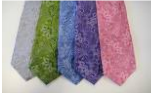
CO050125 Arno Paisley