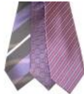
Alfani Red GSM Wardrobe