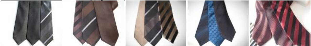
Black Tech Pack